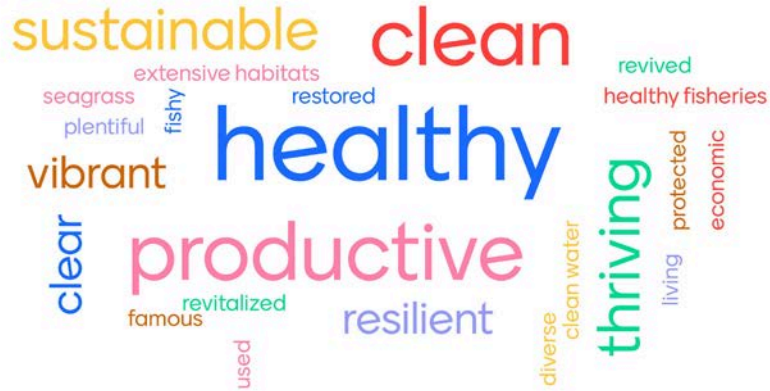
Working Group's Perspectives on a word that best describes their Vision for the bay in 20-years